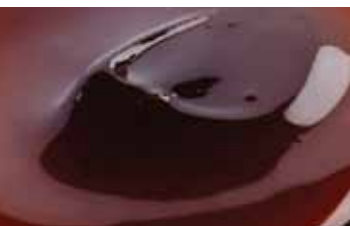
SAUCES, TOPPING AND GANACHE

3 automatic heating programmes for panna cotta, pudding and rice pudding. Easy TTi controls stirring, cooking time, maintaining as well as product outgoing speed.