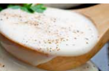
FOOD SERVICE PROCESSING PROGRAMMES

9 programmes for the production of basic pastry products such as paté a bombe, Suisse meringue and custard. Also here the control of each production cycle step is wholly automatic.