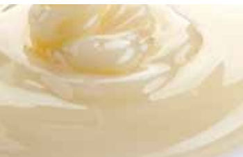
PANNA COTTA, PUDDING AND RICE PUDDING

3 granitas programmes. Easy TTi controls a slow but constant stirring and ensures fine and uniform ice flake without foam-effect.